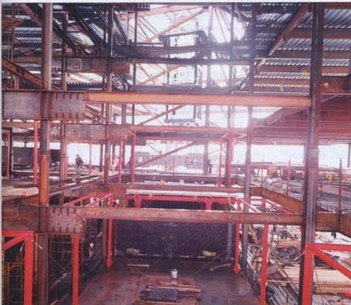
Peri-form (red) in central core.

The new building shape became a clean parallelogram now bounded by Greenwich St. to the East, Washington St. to the West, Barclay St. to the North and Vesey St. to the South. The new smaller footprint would require a building taller than its predecessor in order to fit the same amount of programmable space. In the end, it was determined that only 1.6 of the original 2.0 million sq. ft. of office space was attainable without the use of an elevator sky lobby, a non-starter for ownership. Silverstein Properties wanted a fast, efficient elevator system that did not force tenants to travel on express elevators