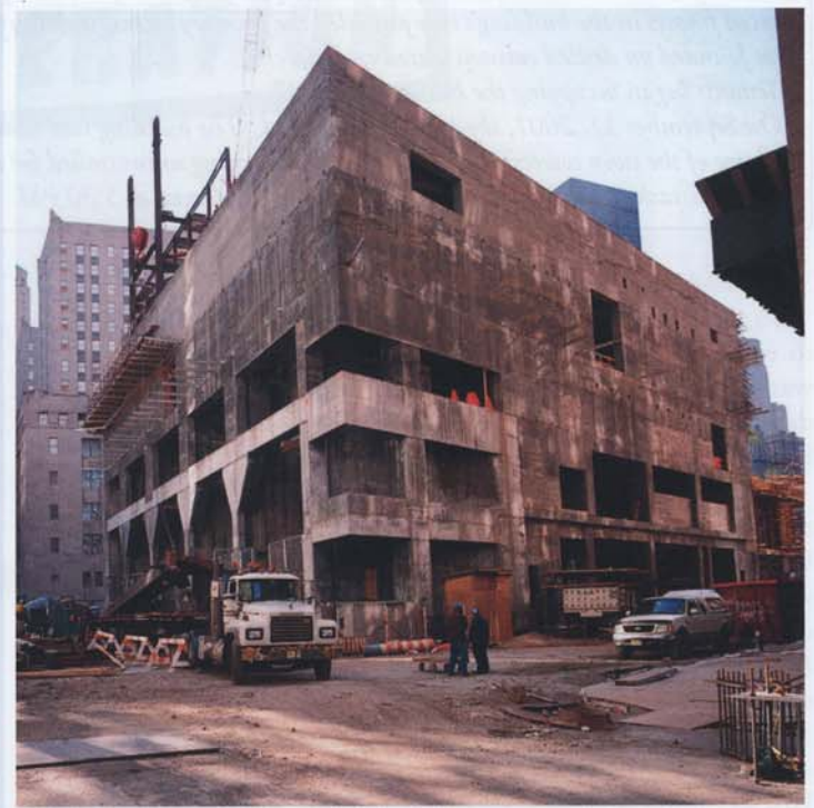
Figure 3: Robust concrete base housing Con Edison Electric substation.

Within the core, the floor system is a reinforced concrete flat plate system. Concrete floors made sense in terms of erection sequencing. They also provided a shallow structural system that gave increased headroom and space for distribution of building services.