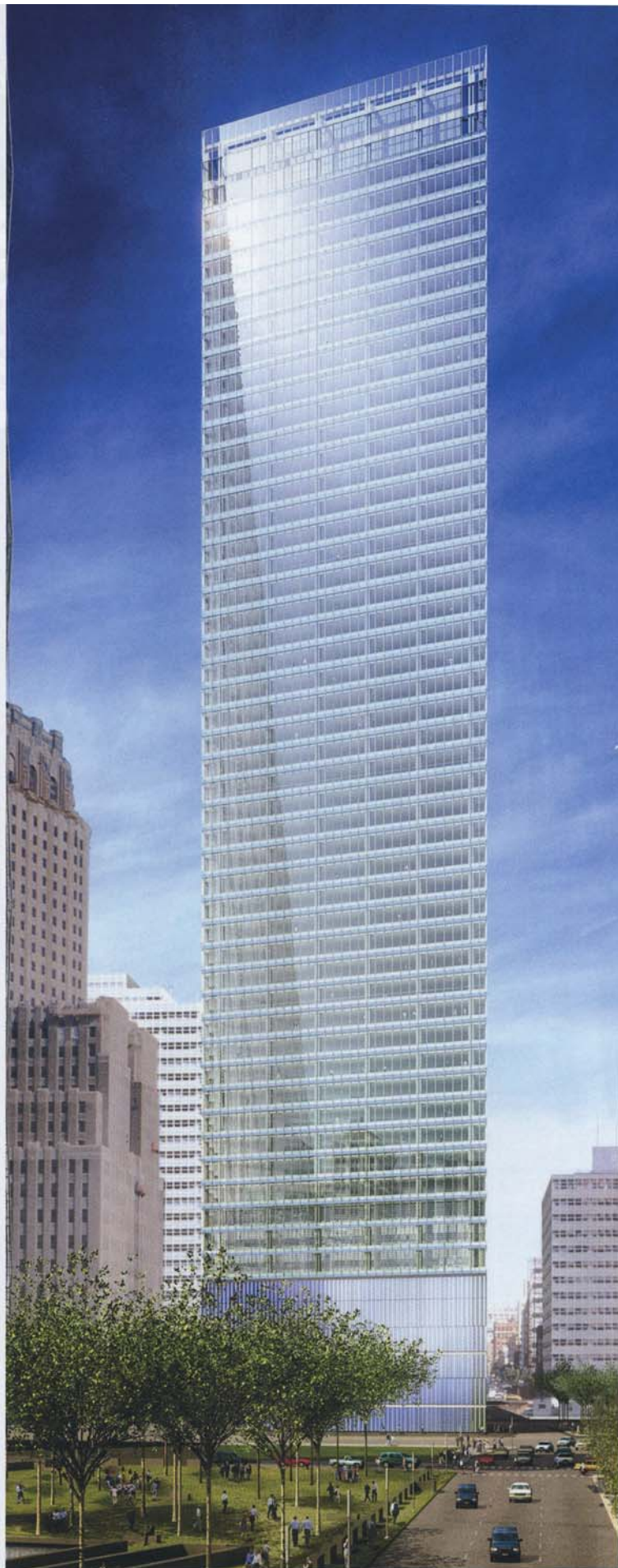
Architect's render of 7 WTC looking north along Greenwich Street.

Portions of this article were previously published in the October 2006 issue of Civil Engineering Magazine (ASCE). Reprinted with permission.