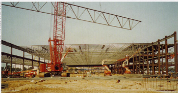
The two buildings used a total of 2,400 tons of A-572 Grade 50 steel.